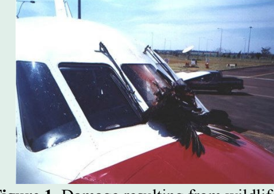
Figure 1. Damage resulting from wildlife strike Methodology

Researchers used the US National Wildlife Strike Database (NWSD) (FAA, 2021a) and the Air Traffic Activity System (ATADS) (FAA, 2021b) to collect data regarding reported wildlife strikes and aircraft movements, respectively. The seasons of the year were assumed to start at the same day during the 10 years within the scope of this study. This study included all Part 139 airports (Figure 2) in the state of Florida (FAA, 2021c) except Florida Keys Marathon International Airport (MTH) and Eglin Air Force