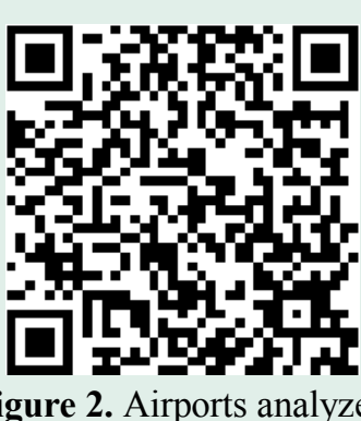
Figure 2. Airports analyzed

Base/Destin-Fort Walton Beach Airport (VPS) since the number of aircraft movements in these airports were not included in the ATADS. Relevant data obtained from ATADS and NWSD were filtered and sorted using Microsoft Excel. A Kruskal-Wallis test was conducted using IBM SPSS to determine the existence of a difference between the wildlife strike index per season of the